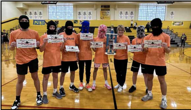
HIPP PJHS Student Dodgeball Champions - The TN Lady Vols!