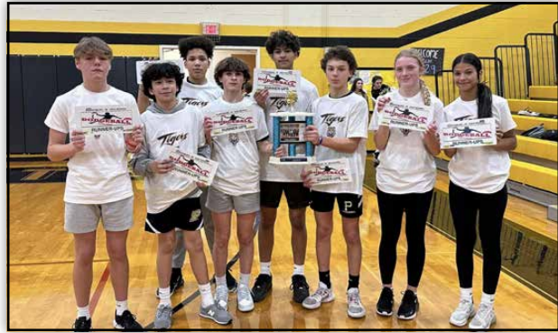
Runner-Ups - The Tigers!